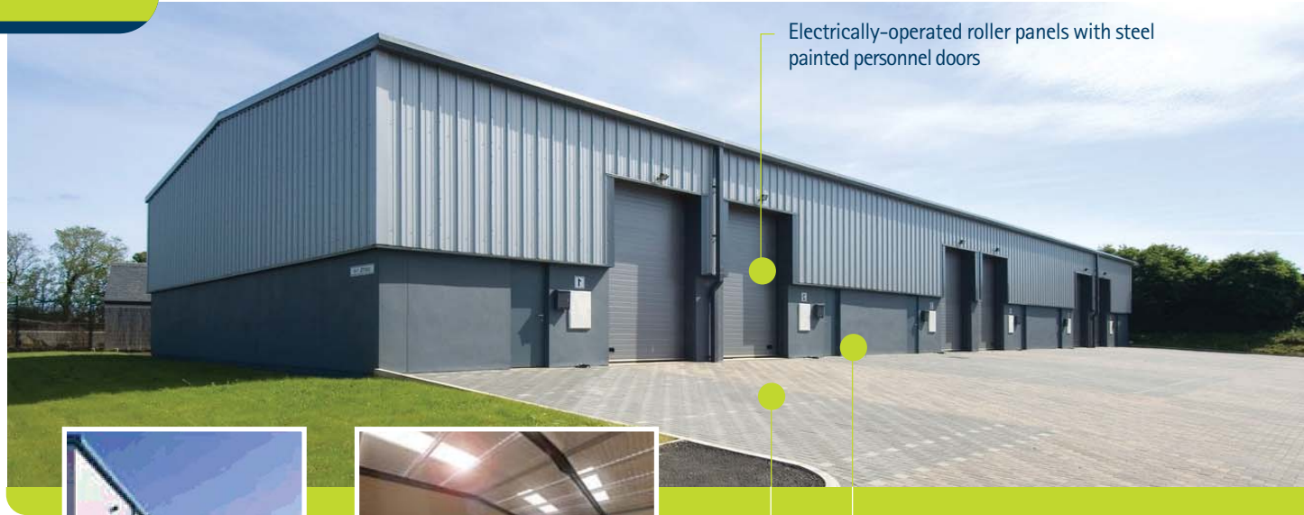
Electrically-operated roller panels with steel painted personnel doors