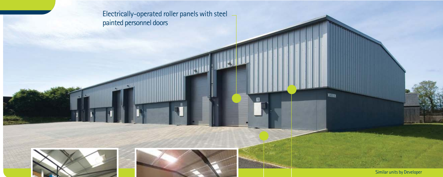
Electrically-operated roller panels with steel painted personnel doors