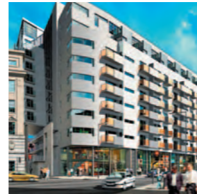
The impressive exterior view from Whitworth Street West a spectacular way to see the piazza and the main route into the building.