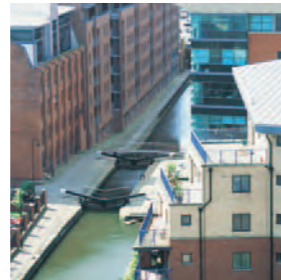
The view from one of the penthouses at The Lock.

Altogether, The Lock Building brings to the city an exclusive new breed of apartment.