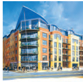
Century Buildings - A stunning collection of contemporary apartments within the centre of St. Helier.