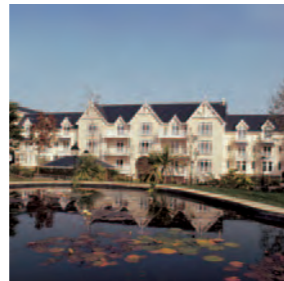
Chateau Royal - This outstanding development situated on the edge of Royal Jersey Golf Club, close to the the beautiful Bay of Grouville, with Mont Orgueil Castle as an impressive backdrop.